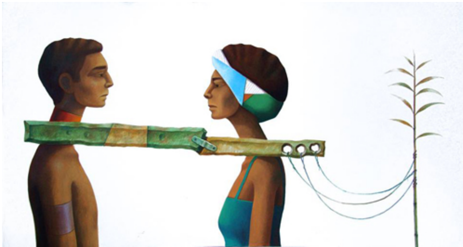
Artwork by Hady Boraey.