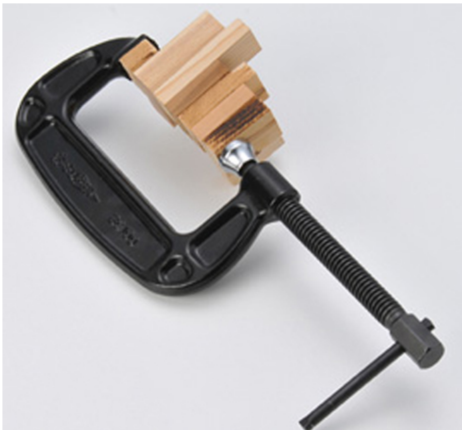
Artwork by Hassan Khan.