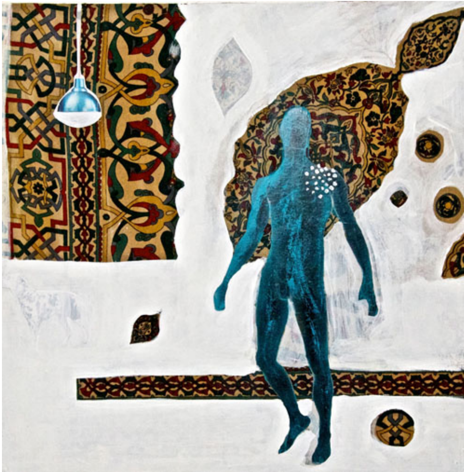
Artwork by Shayma Kamel.