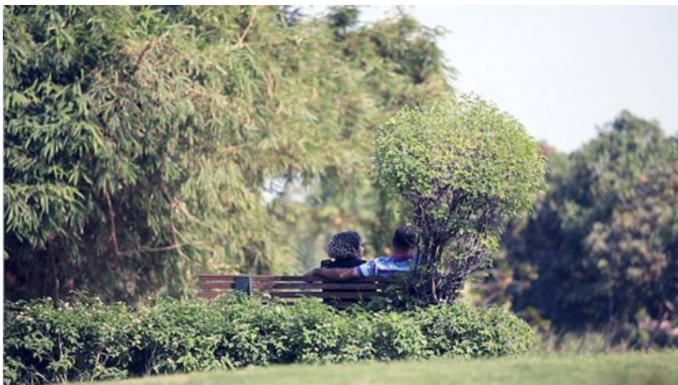
Still from Shooting Stars Remind me of Eavesdroppers.

8 Al-Kamel Mohamed Street, Zamalek, Cairo