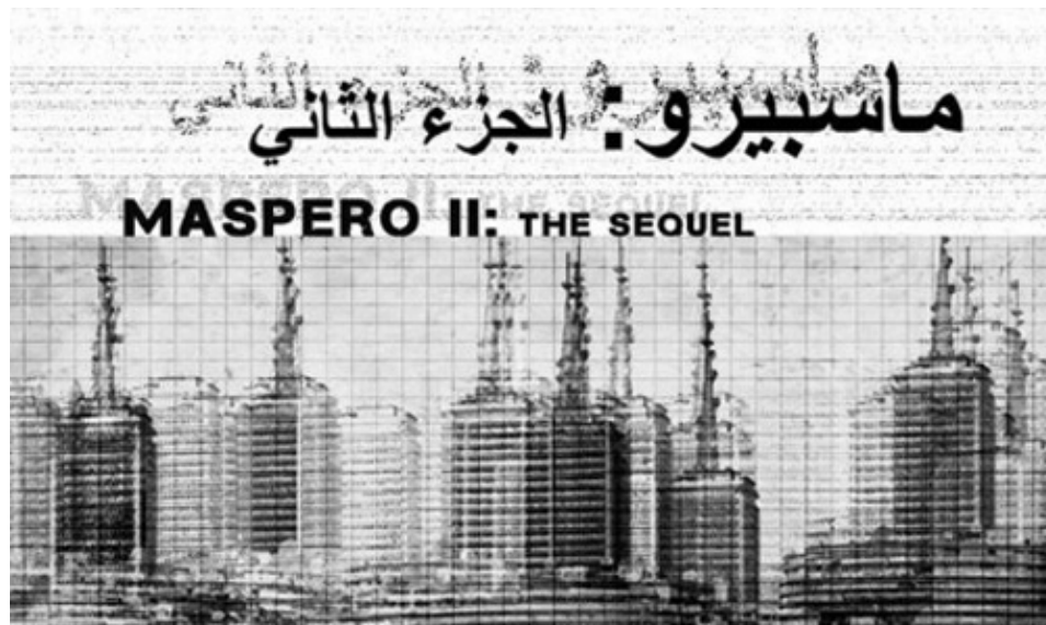
Maspero II: The Sequel

10 Nabrawy Street, off Champollion Street, Downtown, Cairo