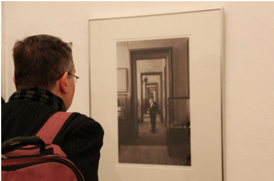
Visitor inspects artwork at The House of Rare Historic Photographs exhibition, Townhouse Gallery.