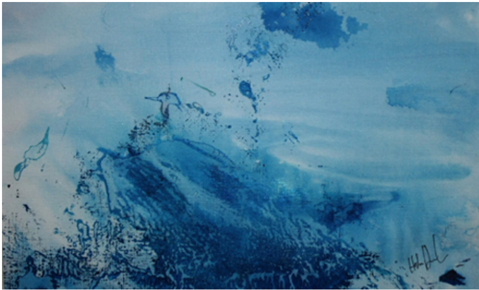
Artwork from "Waves of Distortion" by Heba Hassabo.