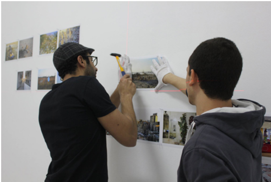
Layer of Green exhibition.