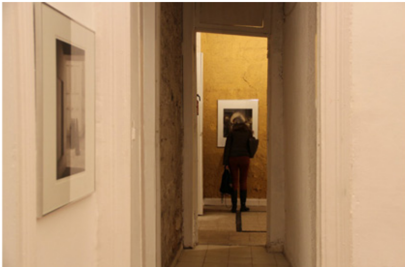
Visitor inspects artwork at The House of Rare Historic Photographs exhibition, Townhouse Gallery.