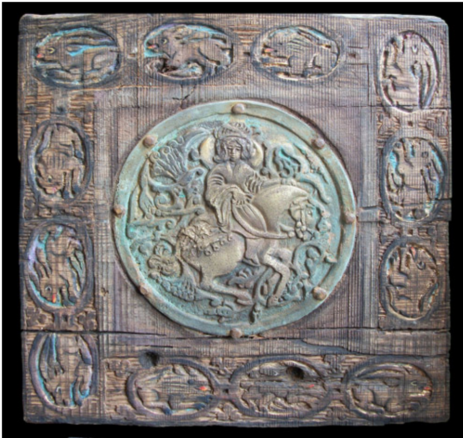
Artwork by Alfons Louis.