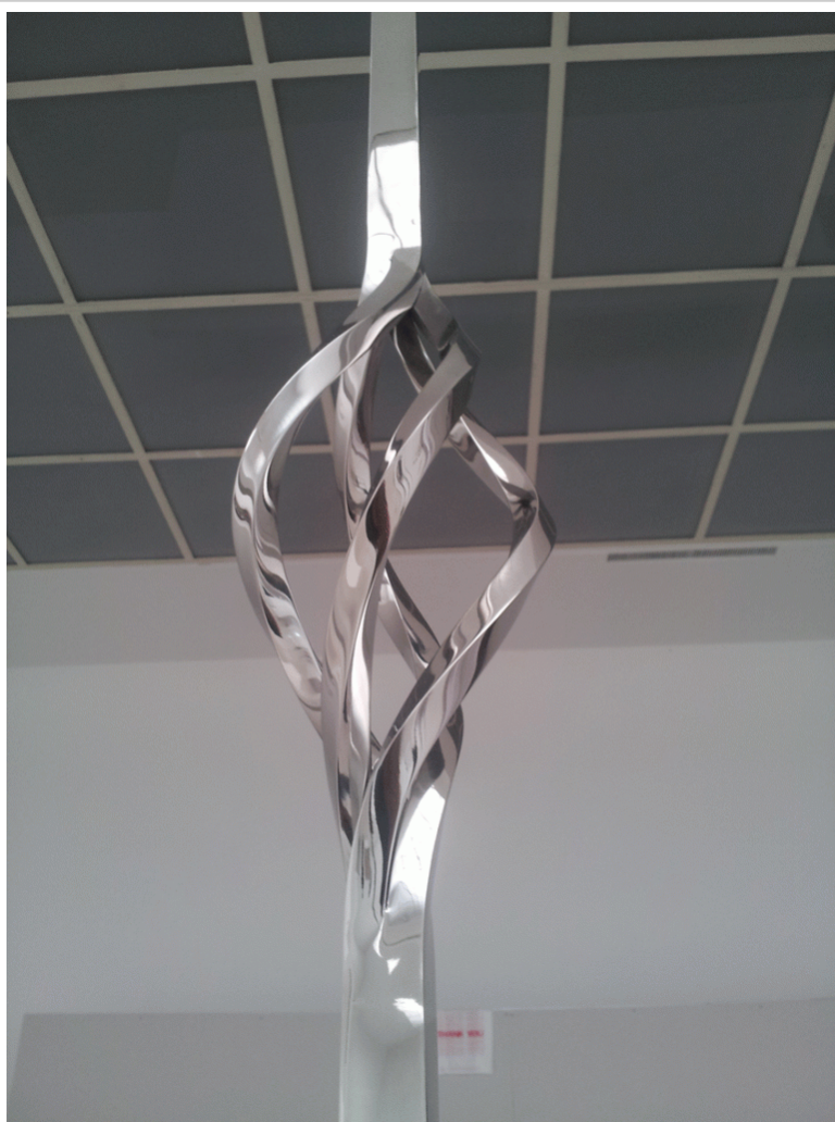
Detail from The Twist (2013), stainless steel sculpture, 322 x 13 cm.

Hassan Khan has never before presented such a large number of works in Egypt as he will at Downtown Contemporary Arts Festival Cairo on Kodak Passageway.