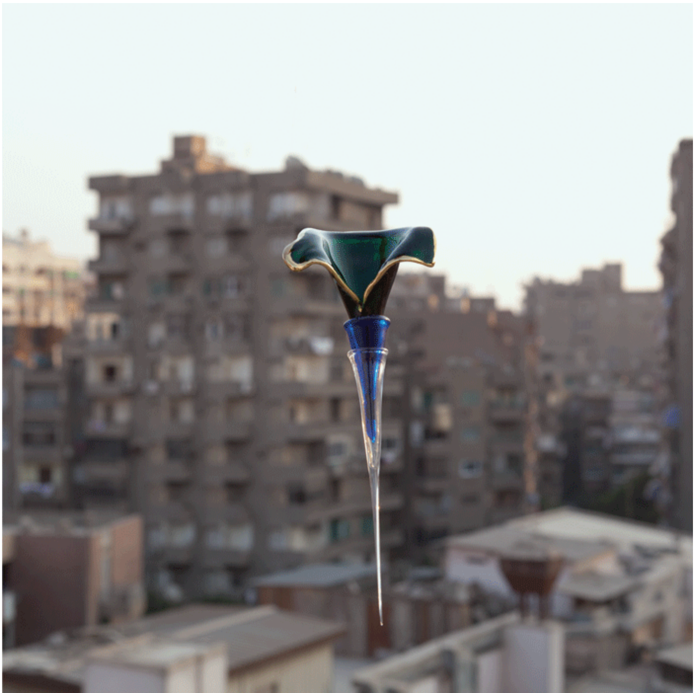
A glass object photographed as a way of collecting the world around it (2013) Photographic Print. 40 x 40 cm.

The selections of works by Hassan Khan in his exhibition at Kodak Passageway span Khan's diverse artistic practice.