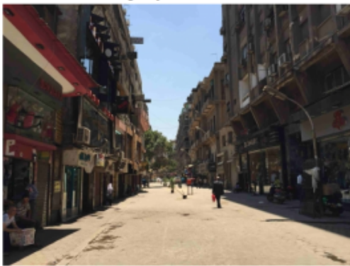
Passageway E4. Al-Shawarbi Passageway

( http://passageways.clustermappinginitiative.org/ )